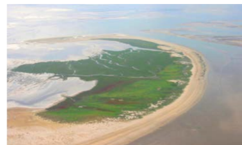
Wadden Sea of Lower Saxony (Germany)