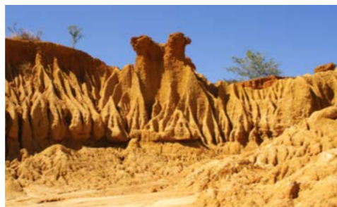
W Region (Niger)