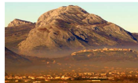
Cilento, Vallo di Diano and Alburni (Italy)