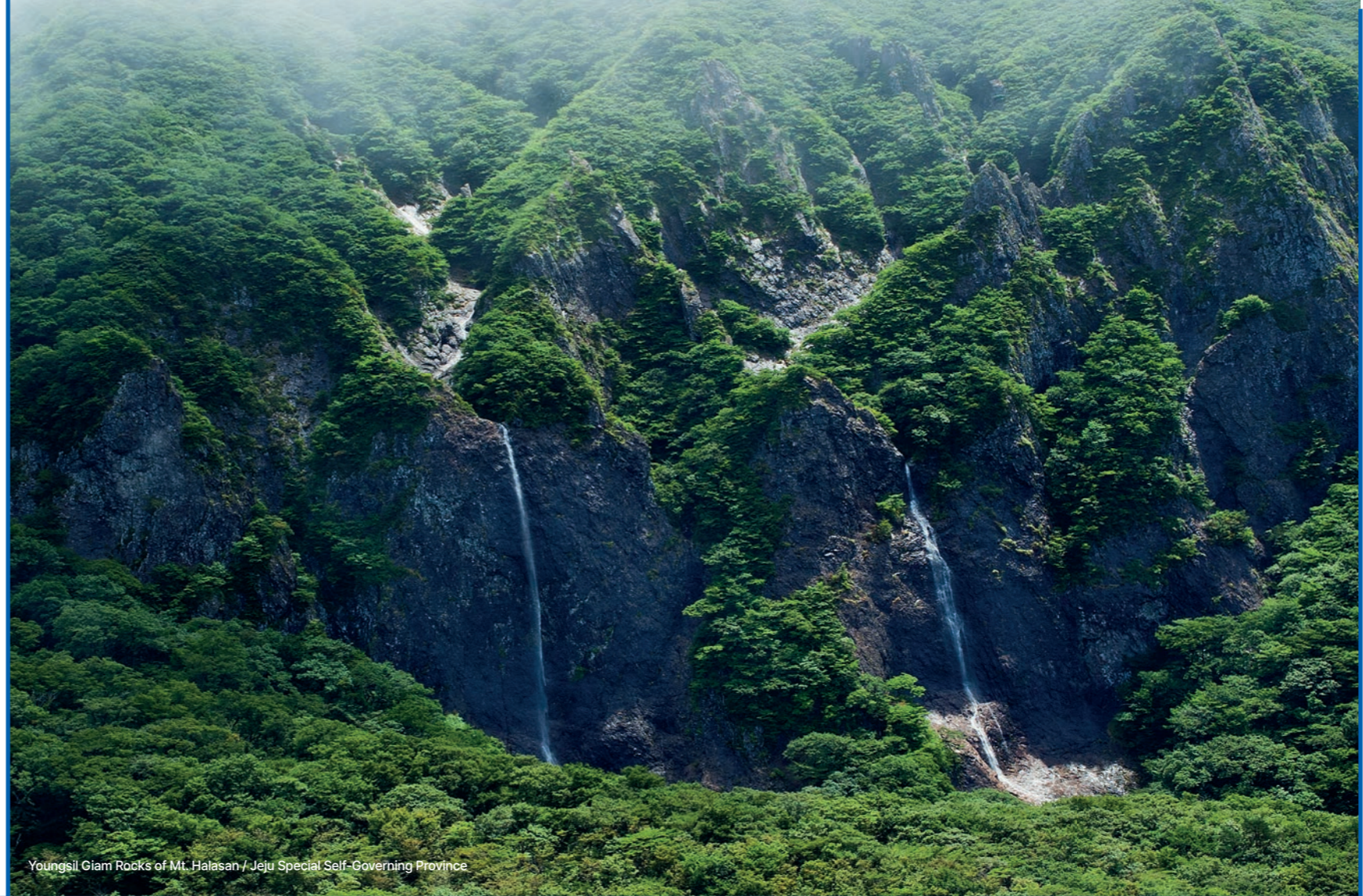
Youngsil Giam Rocks of Mt. Halasan / Jeju Special Self-Governing Province