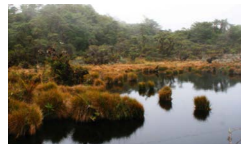
Talamanca mountain range (Costa Rica)